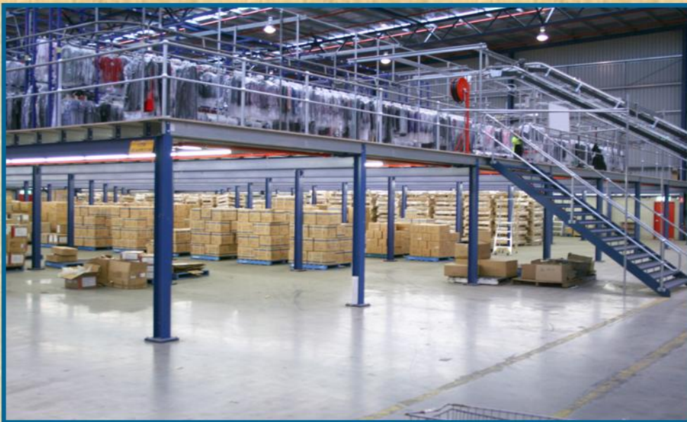
1298 Sq/M mezzanine floor installed at Laverton distribution centre