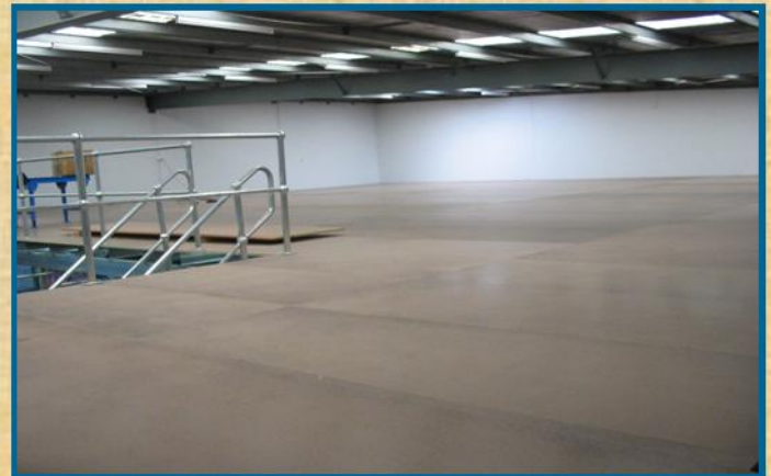
406 Sq/M mezzanine floor installed at Coburg North