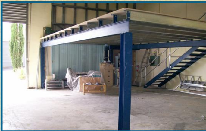
38 Sq/M mezzanine floor installed at Box Hill