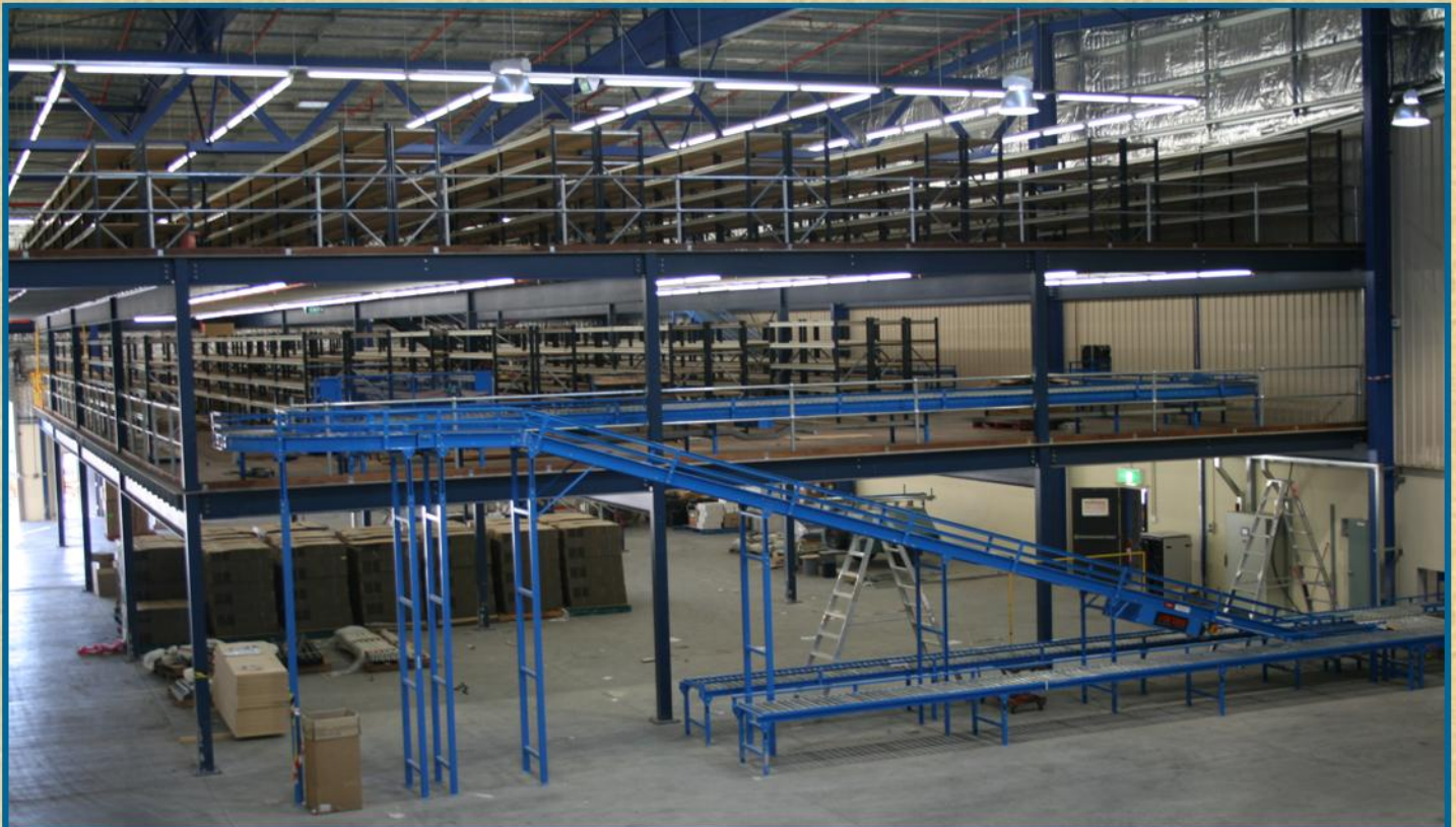
1270 Sq/M double level mezzanine floor installed at Laverton distribution centre

*Above indicative pricing is base on 1600M 2 floor area and does not include GST. Conditions apply.